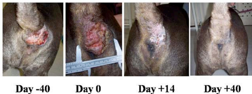
Figure 2: Complete response of grade III MCT

side effects typical associated with this therapeutic class are diarrhea and vomiting. These reactions are usually mild to moderate in severity and typically last less than a few weeks. Moreover, such reactions are transitory, having a comparable frequency to untreated dogs after the first 3 months of treatment. Dogs being treated with masitinib must be regularly monitored by the veterinarian (bi-weekly during the first 3 months, then at least monthly) for side effects including possible protein loss syndrome. Contraindications include dogs suffering from liver or renal function impairment and in dogs with anemia or with neutropenia; in addition to pregnant or lactating bitches, dogs less than 6 months of age or less than 3.4 kg body weight.